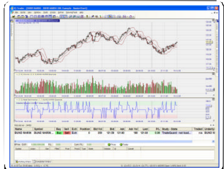
MasterChart – adding multiple sentimentors (studies) to create a meta-sentimentor with working order book