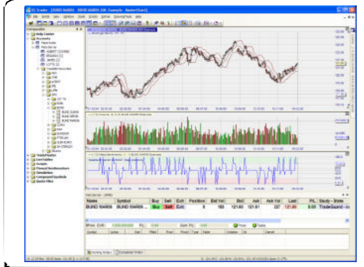
MasterChart – showing WorkspaceBar (left); select commodity and templates, scripts and saved studies

IQ-Trader gives you step-by-step control: you research, configure and then build your trades according to carefully applied strategies and with detailed market intelligence