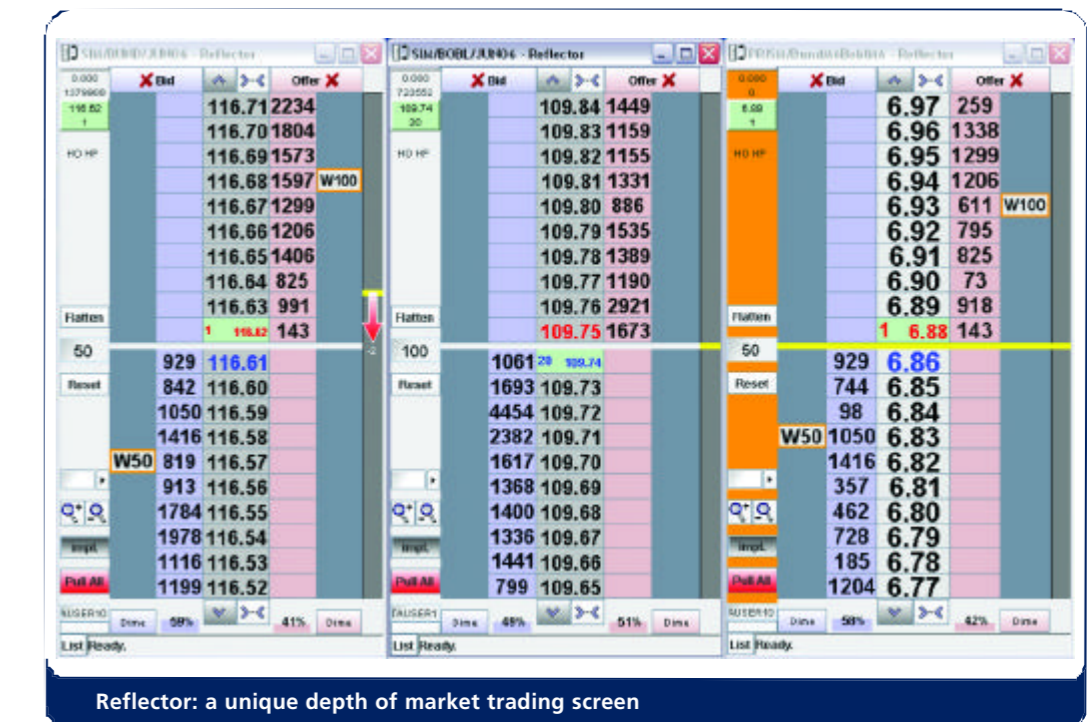
Reflector: a unique depth of market trading screen